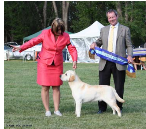
PUPPY IN SHOW KIRKDELL DESTINED FOR FAME