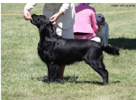
LEFT – VETERAN 7-10 YRS AUST GD CH BUSHMAN BRING IT ON