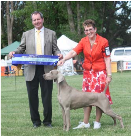
AUSTRALIAN BRED IN SHOW AUST GD CH DIVANI NEW KIDN TOWN TD (Cricket is also VGC 2009 Show Dog of the Year)