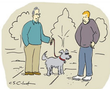
"He dislikes the term 'mutt' - he prefers to be called a 'hybrid'."