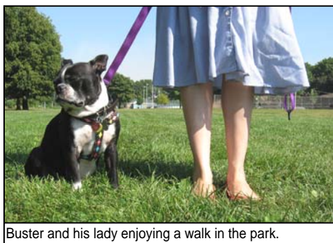
Buster and his lady enjoying a walk in the park.

Hello. My name is Buster , and I have been happily companioned for almost 3 months. Previously, I had been living with an amazing foster family who helped me get over my depression at losing my first companion of ten years. It was quite an adjustment for me, but my foster family was patient and loving. They provided the friendship and security I needed to come out of my shell and into the world again. I was then ready to look for a new life companion.