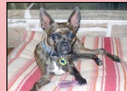
Motley will require thousands of dollars in surgery to correct patella luxation