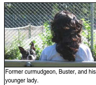
Former curmudgeon, Buster, and his younger lady.

You may remember seeing Buster's profile in the last edition of Rescue 911 where he was featured for adoption. With love, dedication and rehabilitation, even the grumpiest of older dogs can find a fresh new romance and a wonderful environment to call home. It all starts with dedicated foster homes. If you can help a dog like Buster find his happily-ever-after, please contact us!