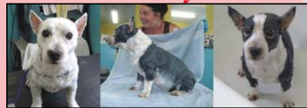
Bara's transformation is truly remarkable!

Lulu was examined by a veterinary ophthalmologist and found to be a candidate for cataract surgery. While many dogs adjust well to losing their sight, BTRC felt that in Lulu's case restoring her vision will help her overcome her fear. The cost of the surgery, however, is close to $4,000.