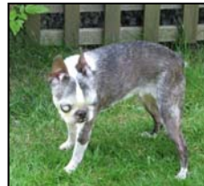
Grandma Betty was in rough shape when she entered the BTRC “Set for Life” program.

Please consider joining our foster program. We need help! There has to be a place for a rescued dog to go, otherwise we find ourselves in the heartbreaking position of turning away dogs like Grandma Betty that need our help. To inquire about fostering please email info@bostonterrierrescuecanada.com Can't foster? Please consider donating to BTRC to help us fund vet care for our rescued dogs. BTRC is a registered Canadian charity and donations are tax deductible.