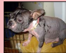
Janie: bald and uncomfortable as she battles demodex with a litter of seven puppies.

The pups, three boys and four girls, are all brindle in colour with long tails. All of them, with the exception of the runt, are above-average in size for Bostons. Guessing the possible breed mix is complicated by the fact that Janie is a bigger girl herself.