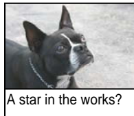
A star in the works?

We have also trained him to be a movie dog, and we are so very proud to announce he will be starring in his first TV show!