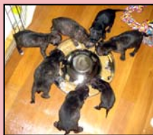
Seven hungry mouths.