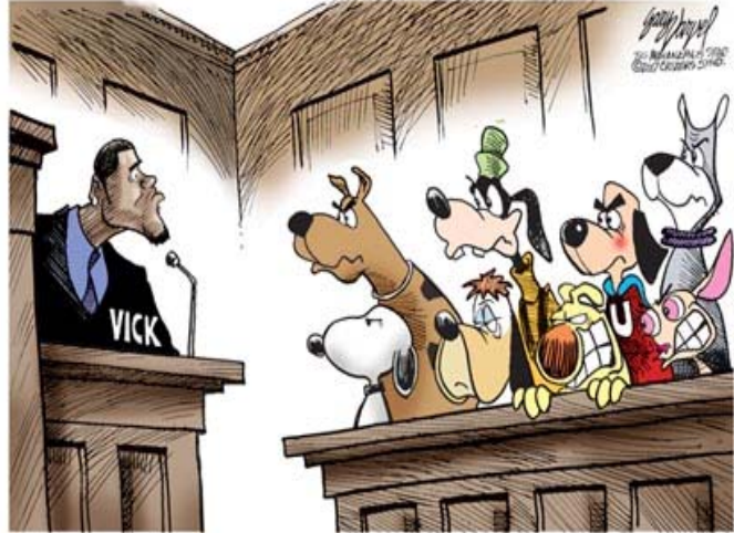
Michael Vick's worst nightmare.....

Healthy Pet Products, Inc. www.healthypetdiet.com