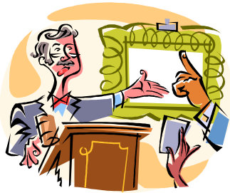
Get ready to have a great time at our 2010 Specialty Auction!