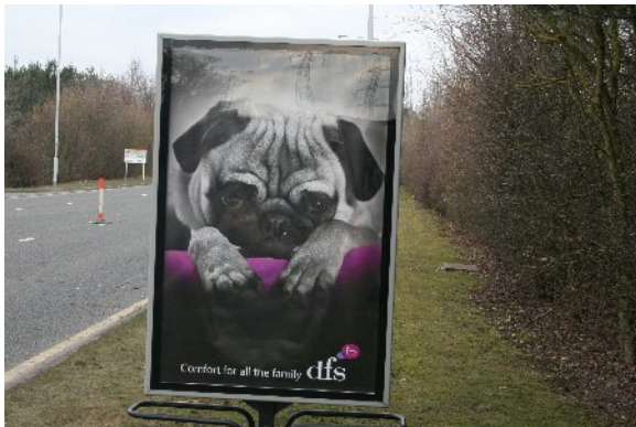
The sign on the motorway while on the way to Crufts!