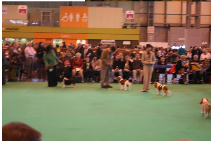
Cavaliers in the ring!