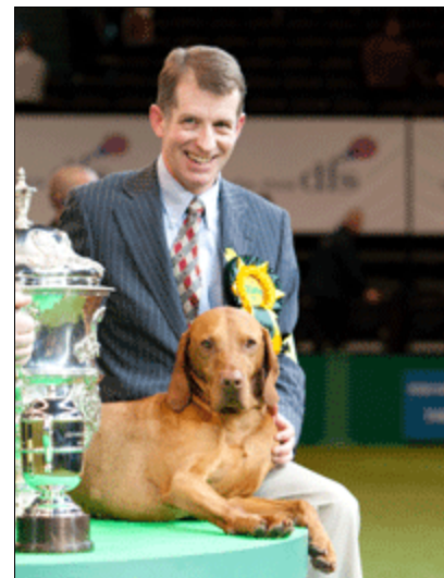
The 2010 DFS Crufts Best In Show went to Hungarian Vizsla SH CH/AUST CH Hungargunn Bear It'n Mind