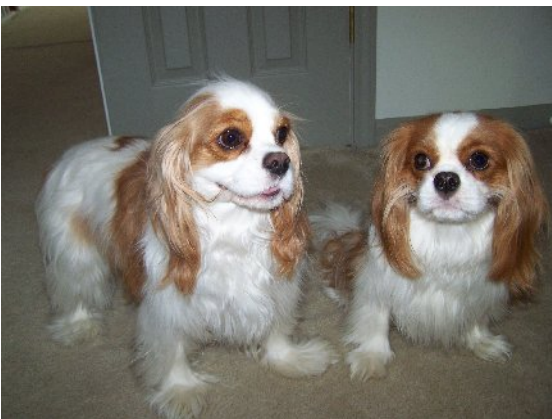
I say old chap, is this the platform for the 10:15 to Victoria?

Well, guess what...NO ONE responded to last month's picture that needed a caption! SOOO...I WIN!!! HE HE!!