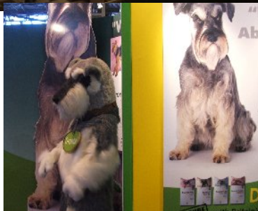
The view of Vendor Booths in only ONE Hall! The Drontal vendor booth & mascot