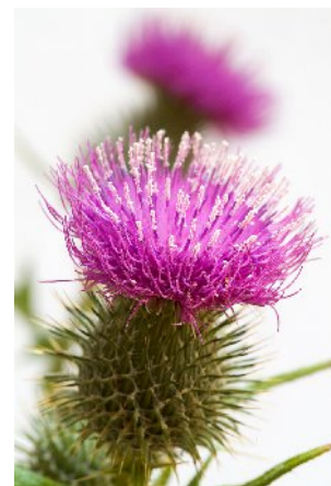
Sharon Onorato Utych

A bit of pollen never hurt anyone but pollen counts in the 6000 range are brutal!