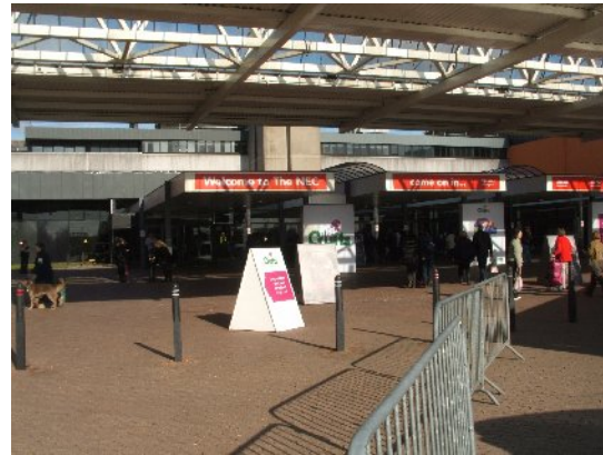
Outside of the NEC building where Crufts is held