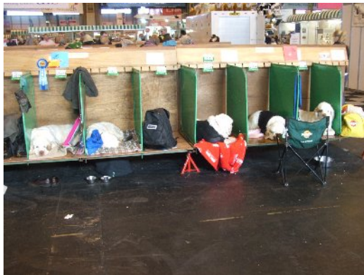
The famous Benched Area clumber spans