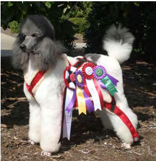
UWP GRCH Sisco's I Like It Like That