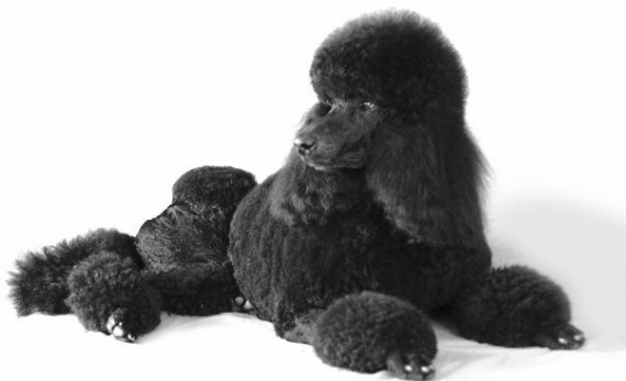
GrCH Tintlet Petite Fille ( GirlyGirl,GiGi)