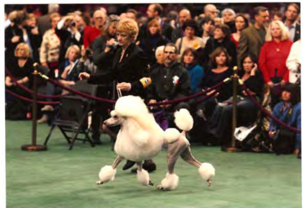
AM, UKC CH CYPRESS SCHEHERAZADE FRONTPAGE